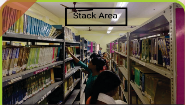
Library Stack Area