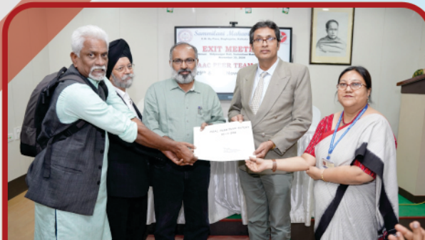
Exit meeting ( PTV)