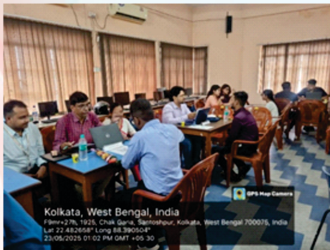
Campus Drive by Career Guidance & Placement Cell

"You must give, if you want to get" - Netaji Subash Chandra Bose