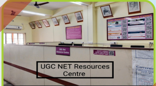
UGC NET Resources Centre