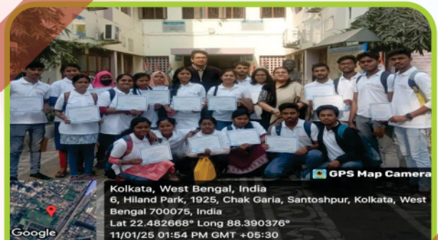
Inter College Competition