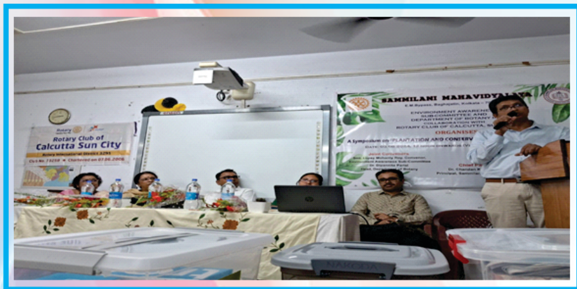
Symposium on “Plantation and Conservation for sustainable Future”

“The true laboratory is the mind, where behind illusions we uncover the laws of truth.” -Sir Jagadish Chandra Bose