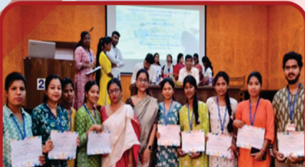
Students Participating in Inter-College Competition