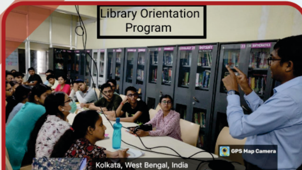
Library Orientation Program