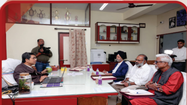
NAAC PEER TEAM VISIT