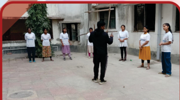
Self defence Course