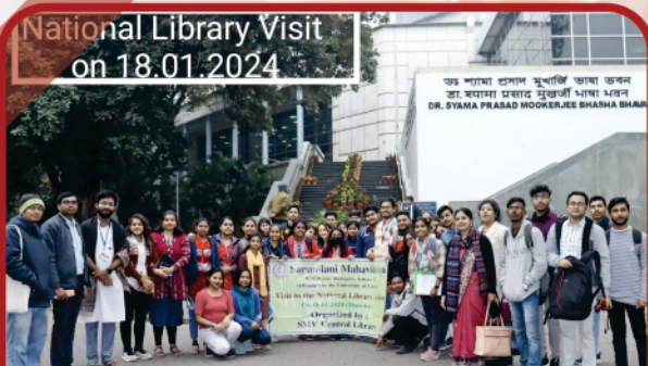
National Library Visit