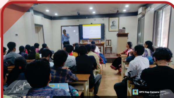
Seminar and Workshop